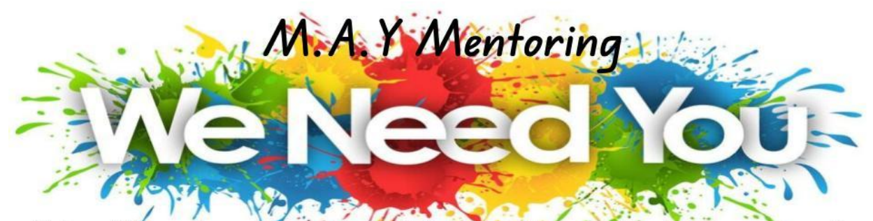
Make a difference in your community and help us to inspire, connect and encourage our youth.

If you know anyone that might be a good fit for the M.A.Y Mentoring program please encourage them to contact me to become a mentor. The commitment is 4 hours a month for I year. The program hosts a 2 hour event every month to engage mentors/mentees so really the mentor and mentee only need to meet 2 hours a month outside the event. We have several waiting students who want to get a mentor and would love to be participating in the program. We thank you in advance for helping spread the word and keep this program strong.